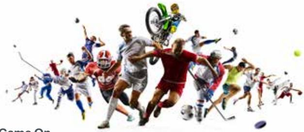
Game On Velada

Unwind over a refreshing selection of cocktails and drinks at our signature bars and dining venues. Buy 1 Get 1 free for selected wines, cocktails, beers, juices and soft drinks.